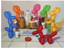
Peanut Butter & Jelly , 2024, oil on linen, 30 x 40 inches, $18,000

“This is my wife’s favorite Beatles song and should really be an anthem more often. A rainbow of life here... let it be.” - RCJ