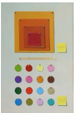
Circles & Squares , 2024, oil on linen, 36 x 24 inches, $13,500

“I rarely see things as a duality. Life is full of nuance, with more gray than black and white. However, it seems we frequently get pushed towards absolutes. As I laid this one out, I really liked the design of bouncing back and forth between the black and white... with the red calling attention to the situation. Some paintings just feel right when I sketch them in my sketchbook, this is one such piece.” - RCJ