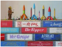
Rocketman , 2024, oil on linen, 30 x 40 inches, $18,000

“Realist painters hear the comment: “Wow, I can’t even draw a stick figure or a straight line” whereas many abstract painters hear “Wow, my kid could do that.” Both statements address skill...an abundance in the first case or lack in the second. However, both statements err in the same way, disregarding what the art is actually about. With this piece I decided to have a little fun with Rothko, making light of the process being as “Easy as 1,2,3.” Hopefully it invites viewers to ponder.” - RCJ