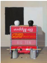
Duality , 2024, oil on linen, 40 x 30 inches, $18,000

“I love irony, a wry sense of humor, and the offbeat. As a result, looking at my Smokey figurine I thought it would be funny to imagine him possessing a pyrotechnic hobby. Of course, when one thinks of fireworks, the ol’ red, white, and blue is right there, too.” - RCJ