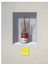
Warhol & Johns , 2024, oil on linen, 24 x 18 inches, $9,000

“This one happened by accident originally. I was using Rodin’s “The Thinker” in a commissioned painting, then set it to the side right by my Pooh figurine and laughed as I saw the unexpected similarity. It occurred to me - The Tao of Pooh - the simple wisdom of this little bear. So the phrase: “great minds think alike” seemed like the perfect start.” - RCJ