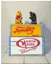
Thinking Alike , 2024, oil on linen, 30 x 24 inches, $13,000

“I am getting close to exhausting the meals my balloon dogs can eat. But darn these little dinner clubs are fun, with their vibrant colors and bulbous shapes. I find my eyes always dance around these canvases, so I’m going to keep thinking of more meals for them to enjoy!” - RCJ