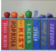
Let It Be , 2024, oil on linen, 28 x 30 inches, $14,000

“This is my wife’s favorite Beatles song and should really be an anthem more often. A rainbow of life here... let it be.” - RCJ